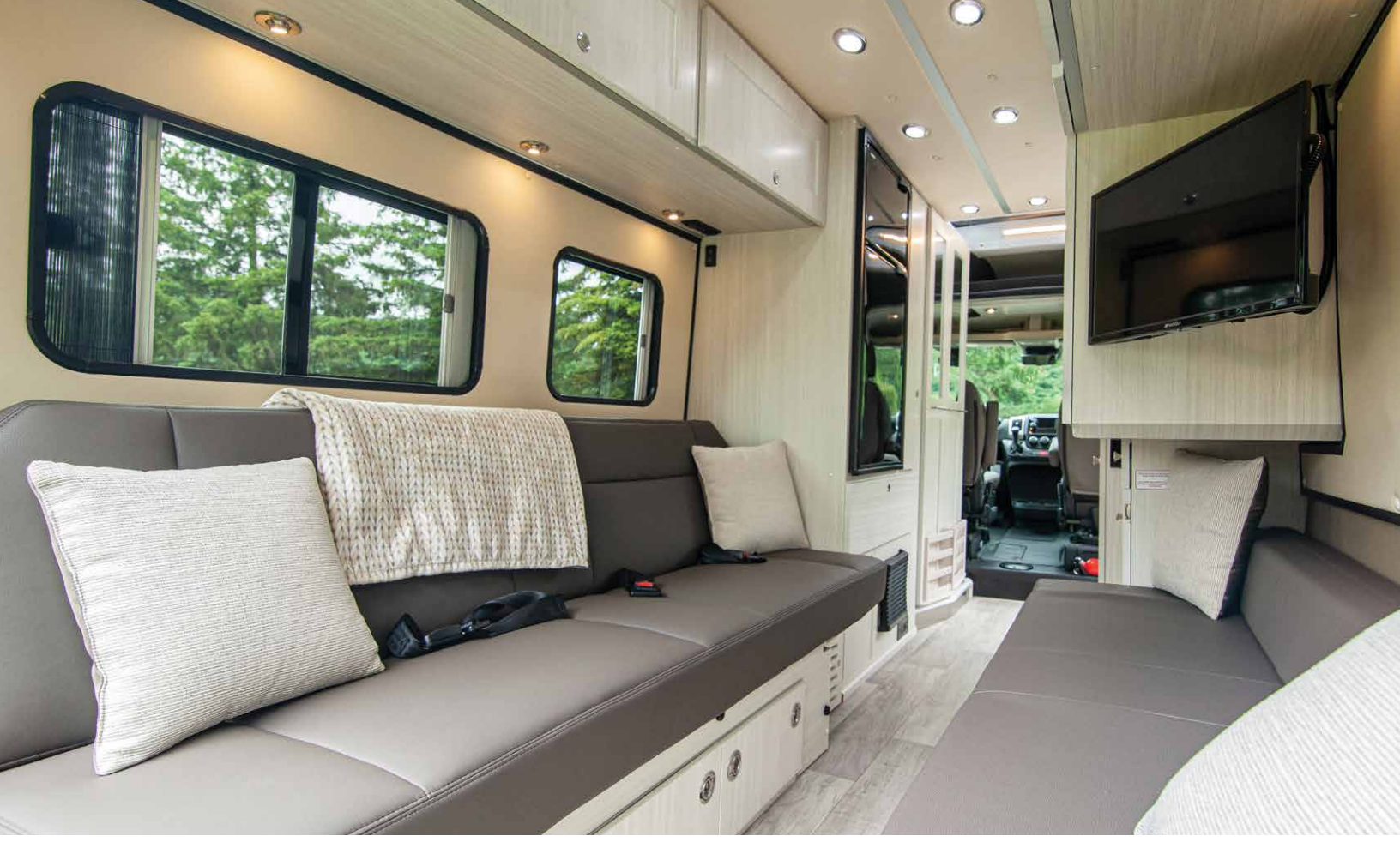
Open aisle floor plan offers unobstructed access to the front and rear of the coach and tons of upper and lower storage.