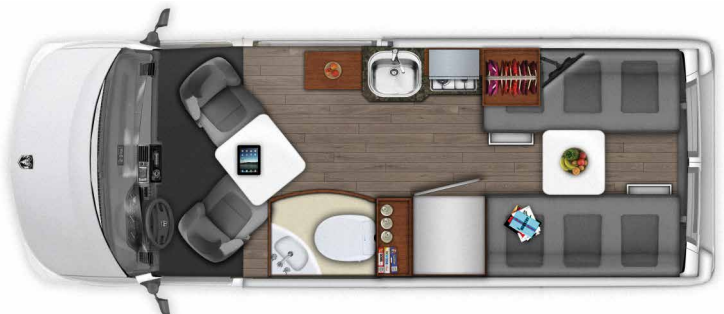
Interior floor plan daytime.