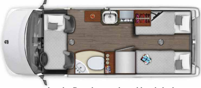
Interior floorplan evening with twin bed set up. (Shown with optional front folding mattress.)