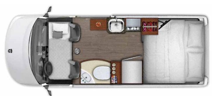
Interior floor plan with king bed set up. (Shown with optional front folding mattress.)