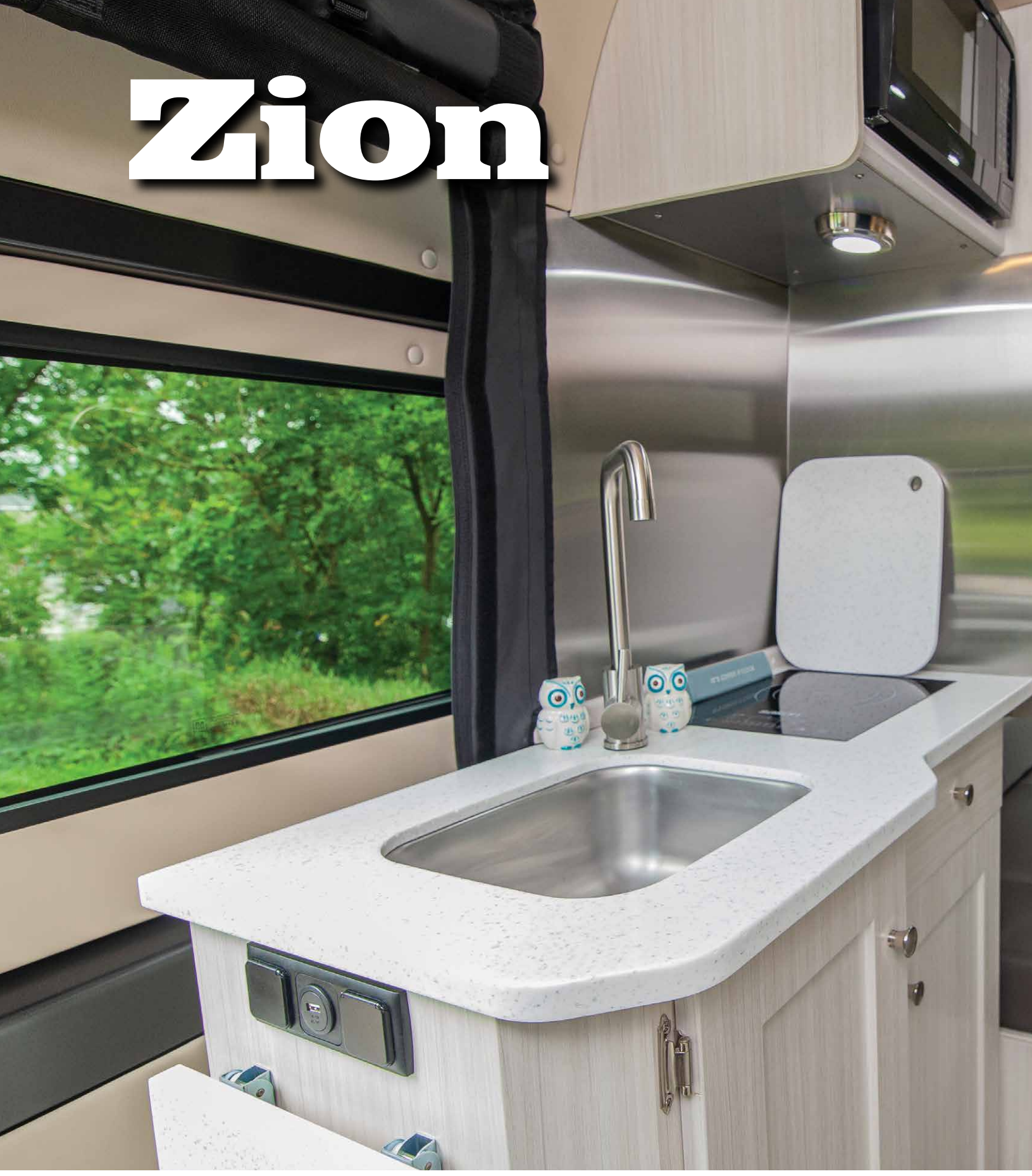
The fully equipped kitchen galley offers a two burner propane stove (optional Induction stove shown), stainless steel undermount sink with flush mount cover, gooseneck faucet, flip up counter extension and lots of storage.