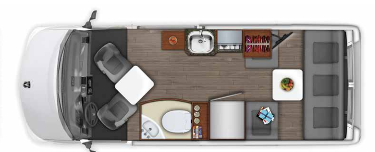
Alternative interior floor plan daytime.