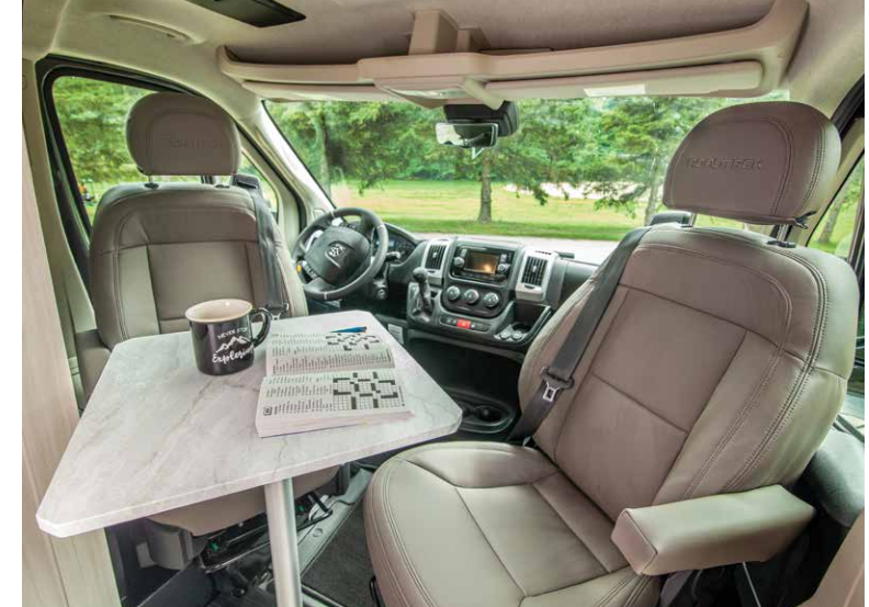
Spacious front dining area comfortably seats two.