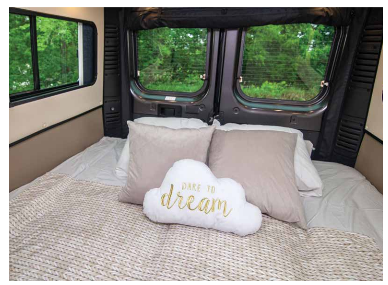
Rear lounge area easily transforms into a sleeping area with a comfortable king size bed.