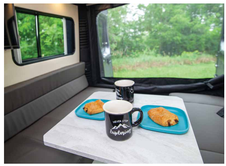
Rear lounge area offers a great place to relax, work or dine.